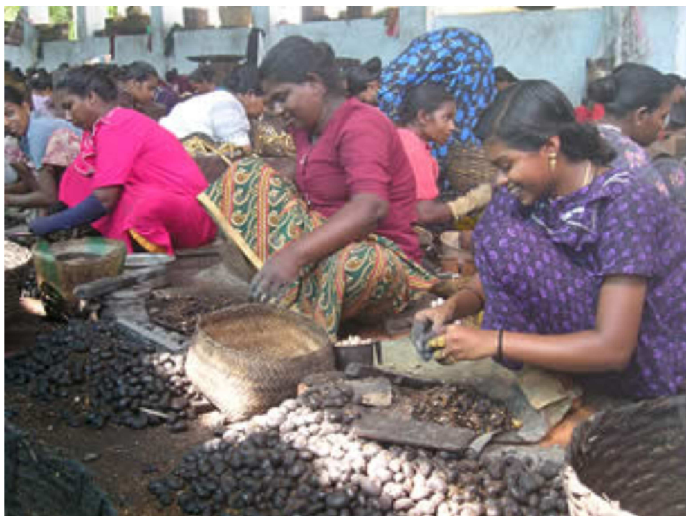
Fig. 2: Manual shelling

It should be noted that cashew nut processing is one of the scheduled employments under the Minimum wages act of 1948.